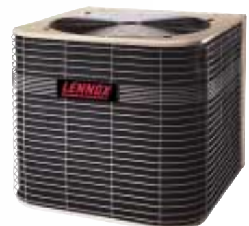
HP27 HEAT PUMP

We're proud of the fact that the HP27 heat pump has earned ENERGY STAR® qualification, which means it meets the EPA's standards for energy efficiency. This translates to year-round comfort and energy savings.